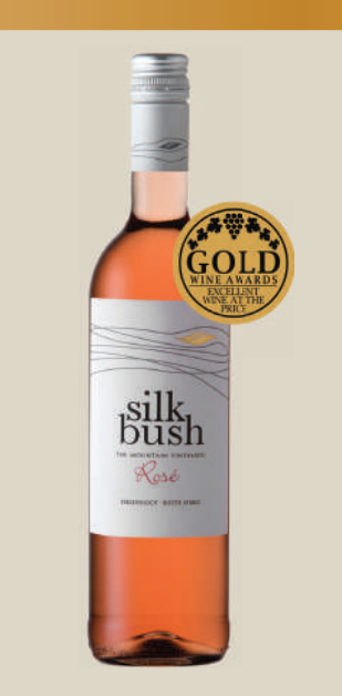
ROSÉ Gold Wine Awards Gold Medal