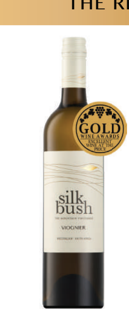
VIOGNIER Gold Wine Awards Gold Medal