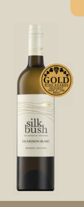
SAUVIGNON BLANC Gold Wine Awards Gold Medal